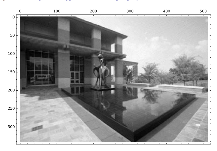
Sage] matrix_plot(A_approx(100), cmap='gray')

But notice the development of artifacts. Taking only 20 of the 341 singular values, a lot is lost: